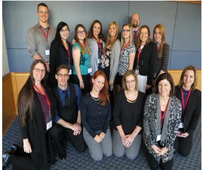
DelVal faculty, undergraduates and graduates at the 46th Annual Pennsylvania Counseling Conference.